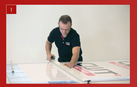
Place the Linear cutter into position.