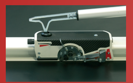
An extension stick is included with every Linear Cutter to provide increased reach when working over a large table top. It can also be used when using a floor surface as workspace.